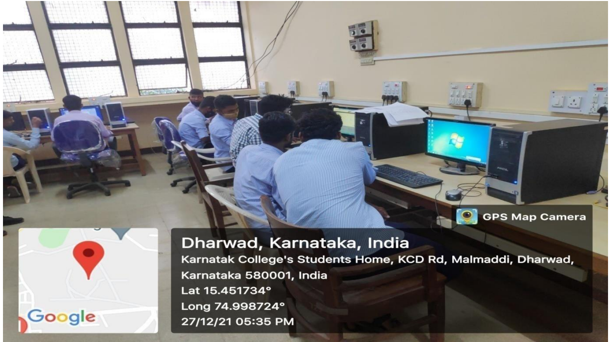
Students browsing e-content from INFLIBNET